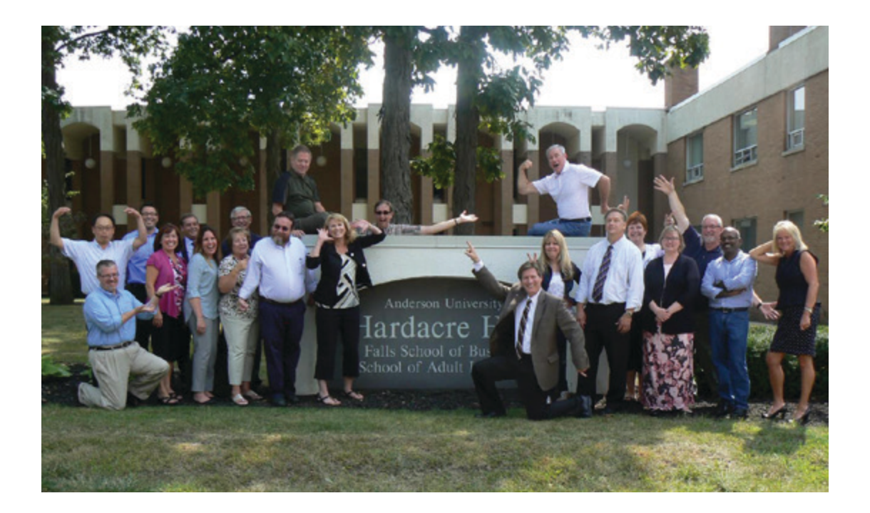
The "real" FSB faculty and staff